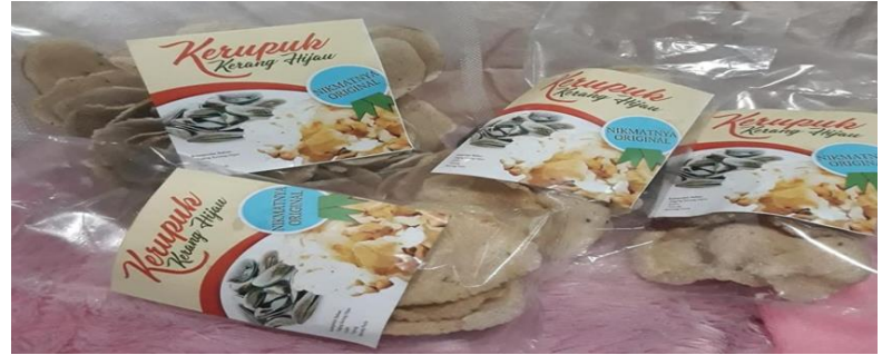
Figure 2. New Packaging of Green Clam Shells

From Figure 2 is the new packaging of green mussel crackers wrapped in clear plastic that has been given a brand name. The packaging of the crackers has been assisted with a plastic adhesive tool (impulse scaler). This is one of the strategies to improve the quality of green mussel crackers. This is also based on previous research from Suniantara, el al that creating a packaging label can improve product quality and generate consumer buying interest (Suniantara et al., 2019).