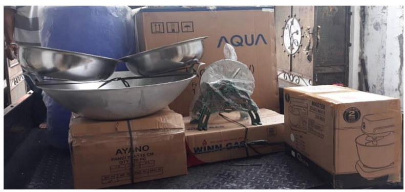
Figure 1. Production Equipment Assistance for Cracker Making

The equipment provided to the group of fisherwives can be seen in Figure 1. The equipment has helped speed up the production of green mussel crackers, not only by making them faster but also by producing more crackers in one batch. The provision of this production equipment is in an effort to increase product quantity.