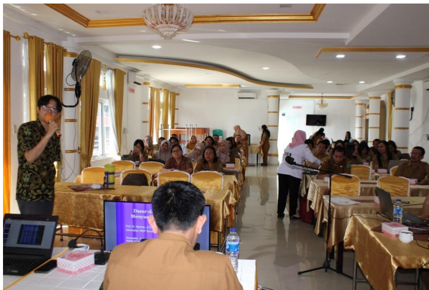
Figure 2. Presentation of socialization activity material by resource persons