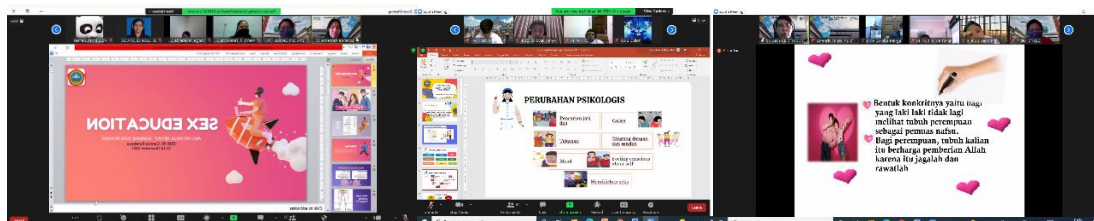
Figure 2 Presentation of Adolescent Psychological Materials

adolescent reproductive health from a psychological perspective. This material informs participants about the changes and psychological maturity experienced during adolescence. Psychological changes in a person sometimes impact problems in young people, including substance abuse, juvenile delinquency, or related problems at school. A person is influenced by their self-concept when acting if one of them is based on psychological aspects. The third session discussed adolescent reproductive health from a spiritual perspective. Spirituality is a form of personal experience that contains religious meaning. Indirectly, this is related to one's view of interpreting life goals and internalizing individual relationships with others, one of which relates to adolescent reproductive health. Spiritual is essentially a continuity with social values that can have an impact on the social life of young people.