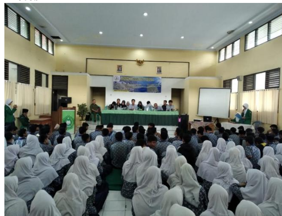
Photo of the Opening of Community Service at MTs Negeri 1 Lebak