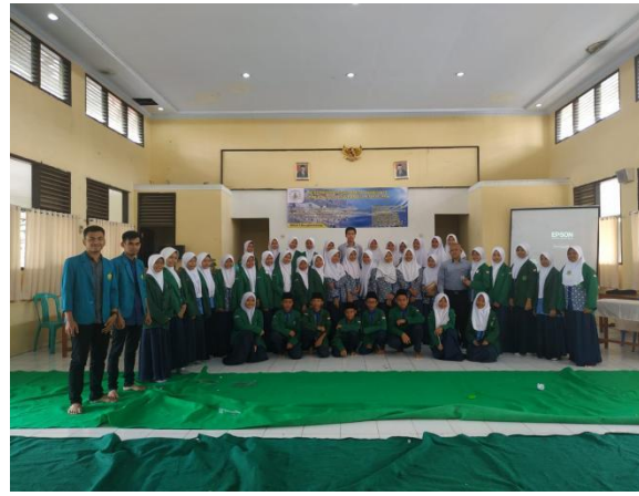
Photo of Faletihan and Student Council Students and the School Health Cadre Team