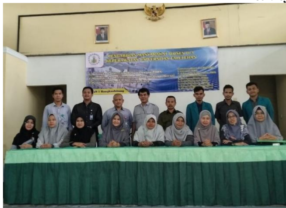
Photo of the Faletchan Lecturer and Principal with the Teacher Council of MTs Negeri 1 Lebak