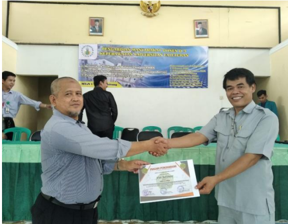
Photo of Awarding Certificate of Appreciation as Resource Person from the Principal