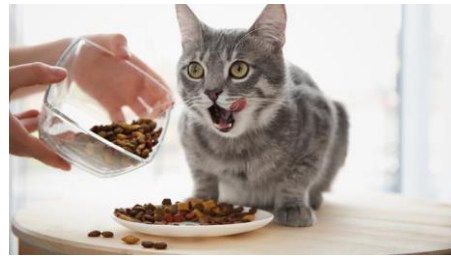
My Pet Cat

Exercise 1. Pick one of the pictures below. After that, make description text with picture provided and like the example below. Example: