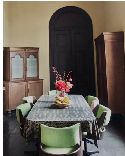
Figure 4 The dining room of the Tjong A Fie family