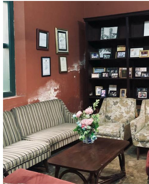
Figure 2 The library room that stores books inherited from Tjong A Fie