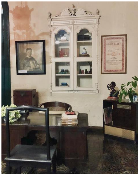
Figure 3 Tjong A Fie's workspace