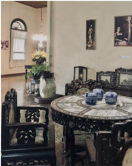
Figure 1 A table with carvings depicting a combination of Chinese, European, and Malay elements