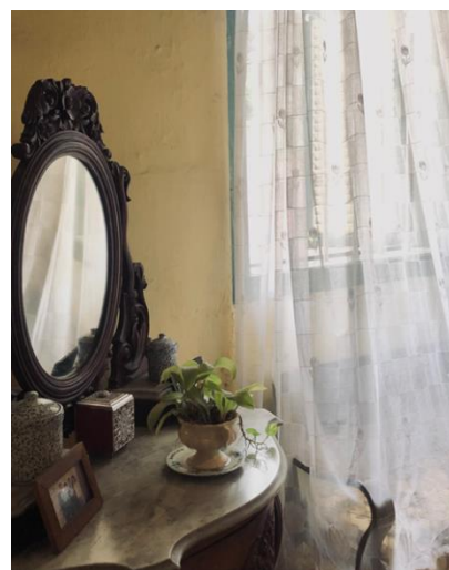
Figure 6 A mirror with beautiful carvings combining European and Malay elements