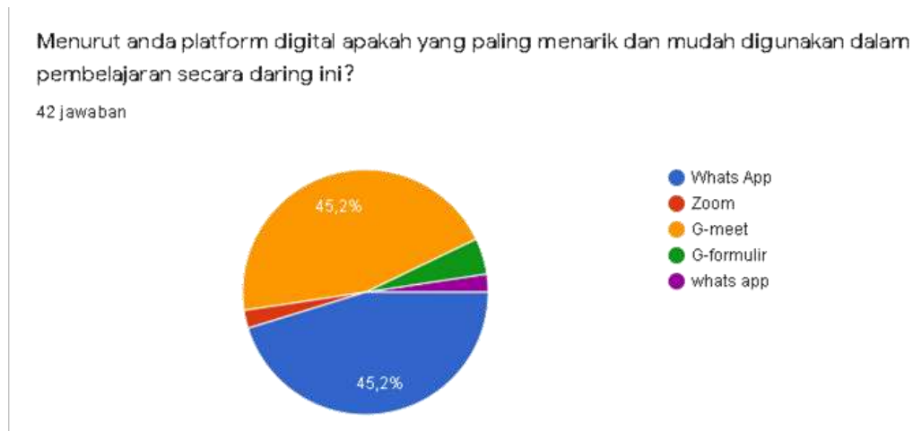
Figure 1. Graph of Variations in Types of Online Applications Used in Learning at SMP Negeri 1 Tenjo

Of the various applications that can be used, online learning at SMP Negeri 1 Tenjo uses many applications such as whatsapp and google meet. In detail, the application variants used by teachers and students in online learning at this school are shown in the following graph.