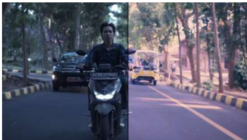
Figure 7. Footage of the before and after color grading

The next stage is to apply color grading to the compiled footages. Color grading is a crucial aspect in the editing stage, as it allows for adjusting the color and lighting of the image and altering the overall tone of the film as needed (Sofiana et al., 2023). A comparison of videos before and after color grading is shown in the following image, where the left side displays the video before color grading, and the right side shows the video after color grading.