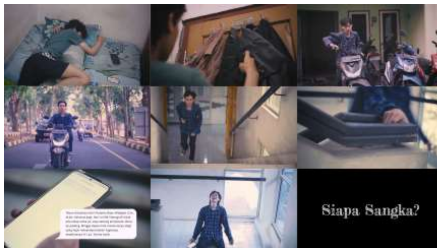
Figure 9. Footage of the short video "Siapa Sangka?"