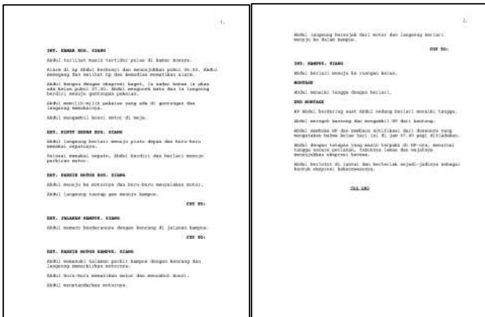
Figure 2. Script of the short video "Siapa Sangka?"

According to (Puspayanti et al., 2018), the script or screenplay is the spirit and core of the filmmaking process. The scriptwriter must be able to understand the story to be raised and then compile it into clear words that are easy for the entire production team to understand (Alfathoni et al., 2021). The script of the short video "Siapa Sangka?" can be seen in the following image: