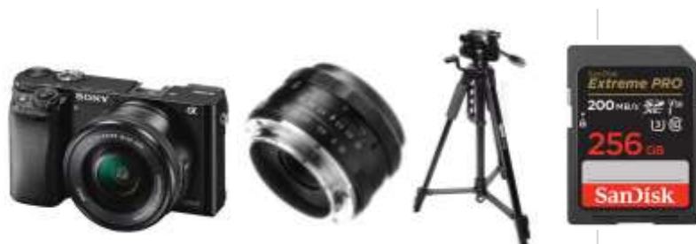
Figure 4. Image recording equipment

The process of recording images or filming utilizes several tools, including a Sony A6000 camera, a Meike 50mm F/2.0 fixed lens, a tripod, and a memory card.