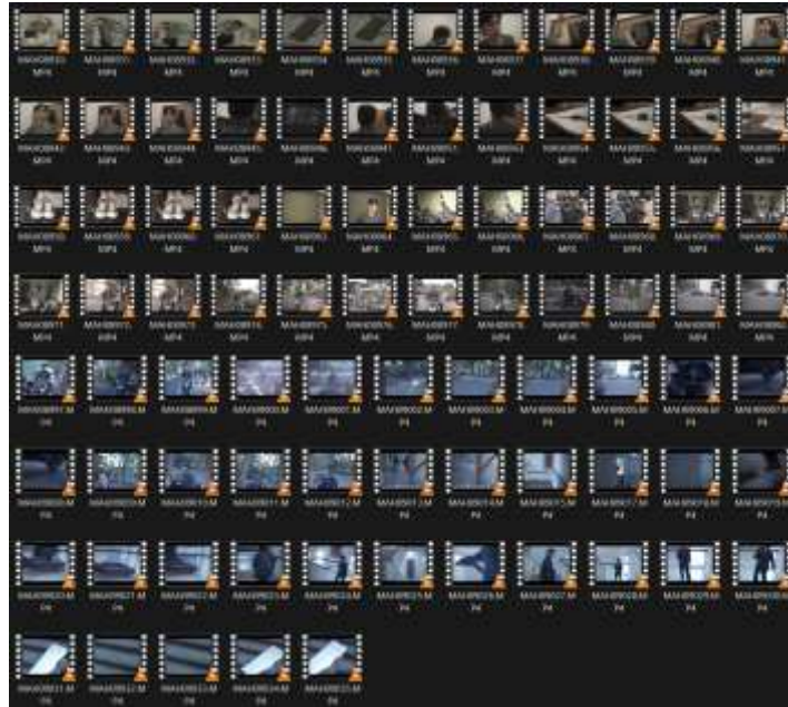
Figure 5. Raw Footages

produced 86 raw footages in .mp4 format with full HD resolution of 30 fps, which will then be processed at the post-production stage.