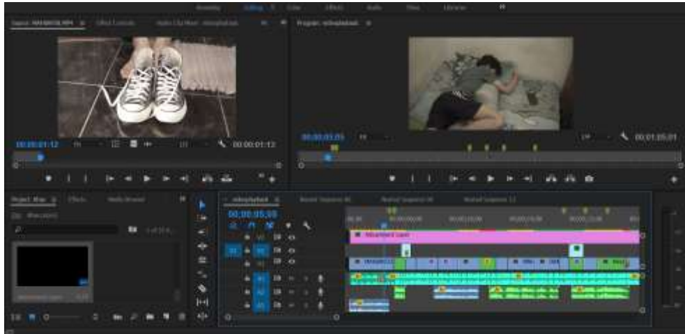
Figure 6. Editing with Adobe Premiere Pro CC 2017