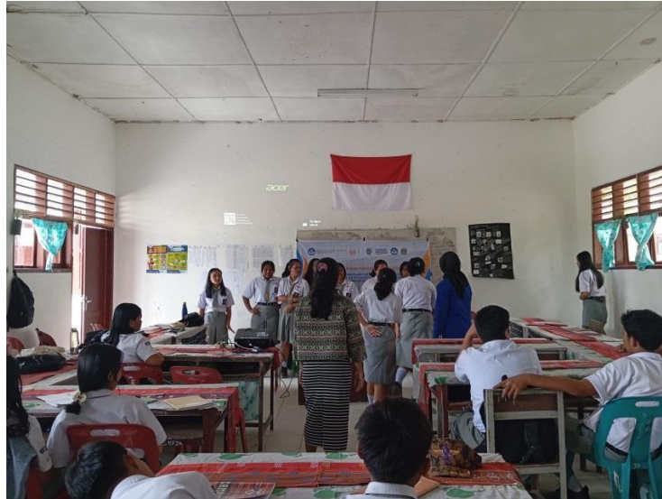
Figure 6. The atmosphere of post-test activities to students in the form of games

At the end of the activity, the students were given the opportunity to give impressions/messages as a follow-up to their understanding of venereal diseases due to not maintaining reproductive organs. They said that they were very happy with the activity, because they got new knowledge about venereal diseases and how to maintain reproductive health.