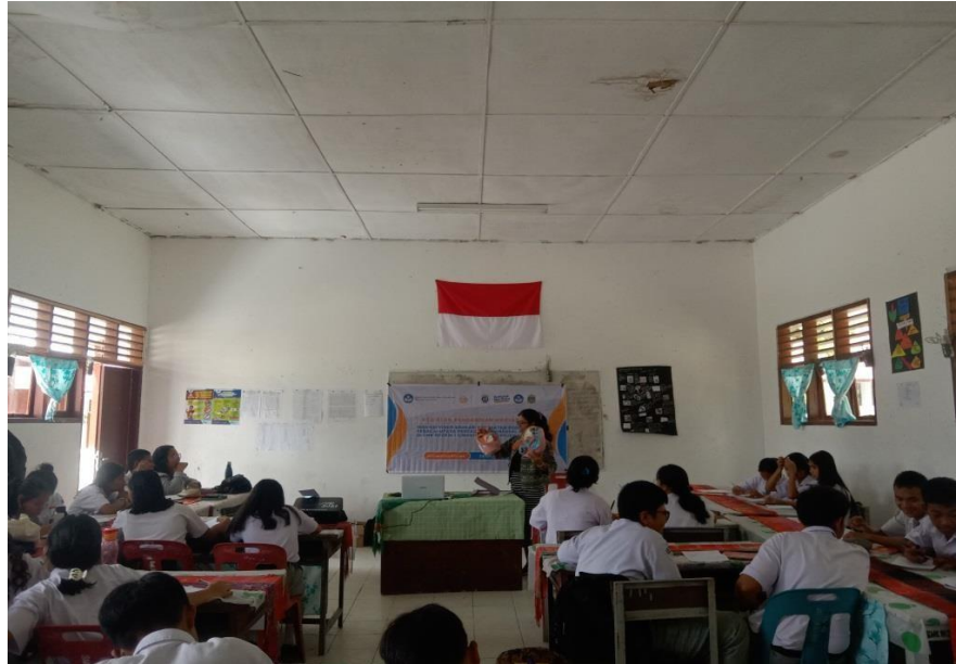
Team members explaining through phantom props