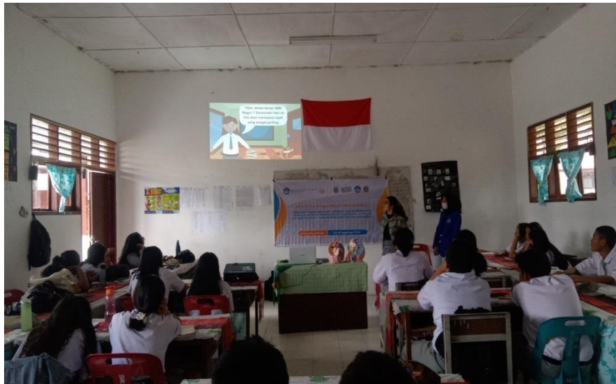
Figure 5: The atmosphere of students listening to material through video innovation After the counselling and discussion, at the end of the material the team held a post

Test in the form of asking questions in the form of a game. Those who can answer the questions will be rewarded, namely getting candy that has been provided by the PKM team. The game in the framework of the post test went smoothly and enthusiastically. Students became more open in terms of reproduction and puberty that they experienced.