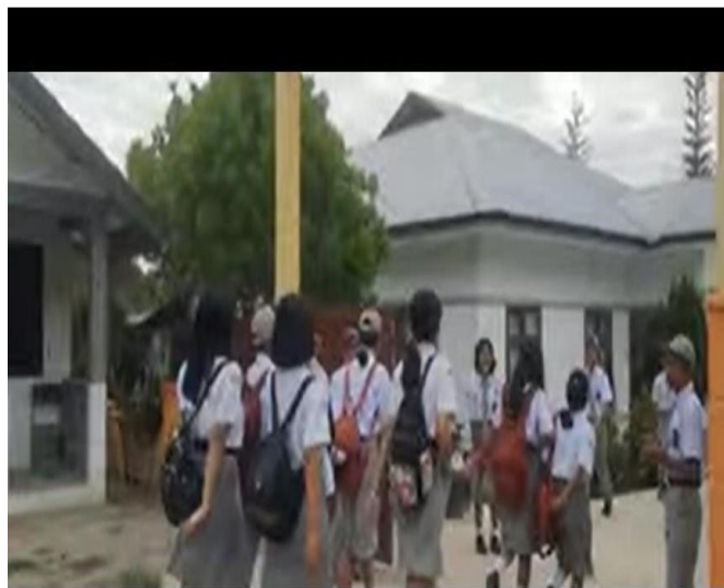
Figure 1. The atmosphere of students entering the school in the morning at SMK Negeri 1 Simanindo