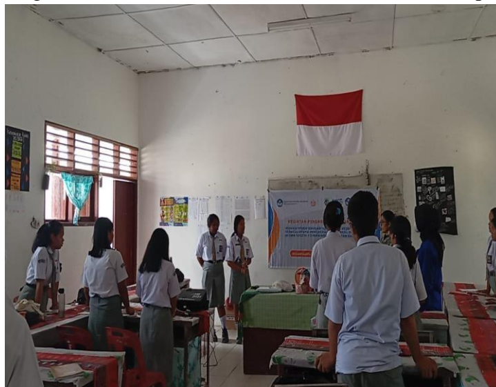
Students give impressions and messages from the activities carried out

At the end of the activity, the students were given the opportunity to give impressions/messages as a follow-up to their understanding of venereal diseases due to not maintaining reproductive organs. They said that they were very happy with the activity, because they got new knowledge about venereal diseases and how to maintain reproductive health.