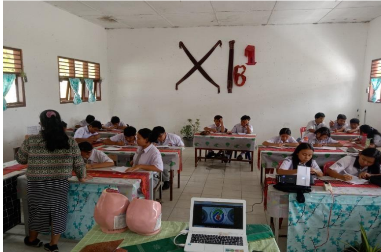
Figure 3. The atmosphere of pre-test activities (students answer questions on a piece of paper)

From the data, it can be concluded that the students of SMK Negeri 1 Simanindo still lack understanding about reproductive issues and when asked, some of them said that talking about reproduction is embarrassing and taboo, and some even never discussed it in the family or at school. Only a few students get good education about reproduction and get it from the family.