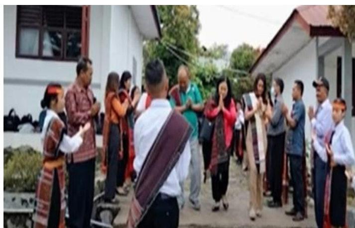
Figure 2: Principal welcomes guests, the atmosphere still holds customs