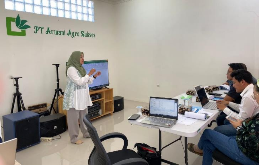
Figure 2: Submission of Basic Accounting Material

in the implementation of the workshop, the first thing that was done was to deliver material on the basics of accounting, especially those related to BUMDes accounting.