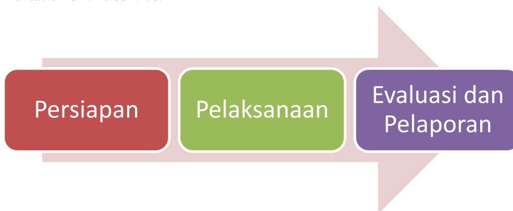
Figure 1. Activity Phases

The BUMDes Accounting Workshop is structured with a systematic approach that includes theory, practice, and interactive discussions. This method of implementation aims to ensure that BUMDes managers can understand accounting concepts in depth as well as apply them in daily financial management. The following are the stages carried out in the implementation of this service: