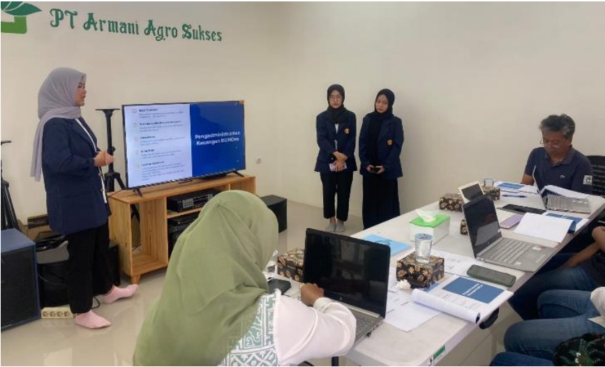
Figure 3: Demonstration of Excel-based BUMDes SIA

Next, the student team carried out a demonstration of the BUMDes accounting recording process using an Excel-based application, which later this application will be handed over to the BUMDes. The demonstration carried out included inputting transactions based on illustrations of transactions that usually occur in BUMDes. Furthermore, it is also demonstrated how the posting stage can then produce financial reports.