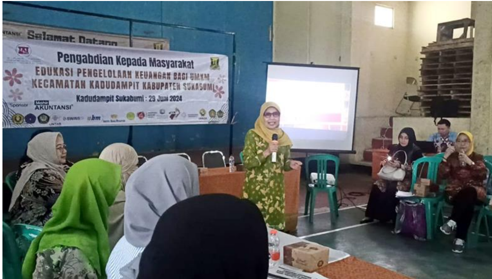
Figure 4. Presentation of accounting material by the PKM Team