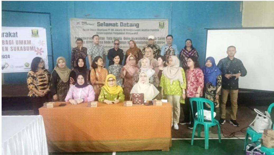
Figure 7 Photo together with the PKM Team

The post test was given to 30 business actors consisting of three villages, namely tourism MSMEs, processed food MSMEs, trade and agriculture MSMEs. The results of the evaluation showed that 90% of MSME participants were able to prepare good accounting after participating in the community service activities.