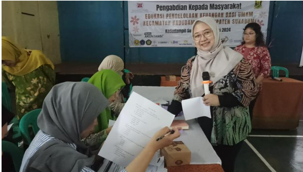
Figure 5. Discussion with PKM Participants

MSMEs must be able to establish good relationships with customers, because in building an MSME business, customers are kings with the hope of coming back to buy again. Improve the quality of the products produced, both in terms of taste, price, and packaging. MSMEs are a significant source of income for the community. MSMEs not only create jobs, but also increase community income. By focusing on developing local products and empowering small business actors, MSMEs play a key role in strengthening the local economic ecosystem. How do MSMEs know market needs and utilize social media to sell their products? MSMEs promote using online platforms. in accordance with technological developments and continue to innovate 3.4 Activity Evaluation