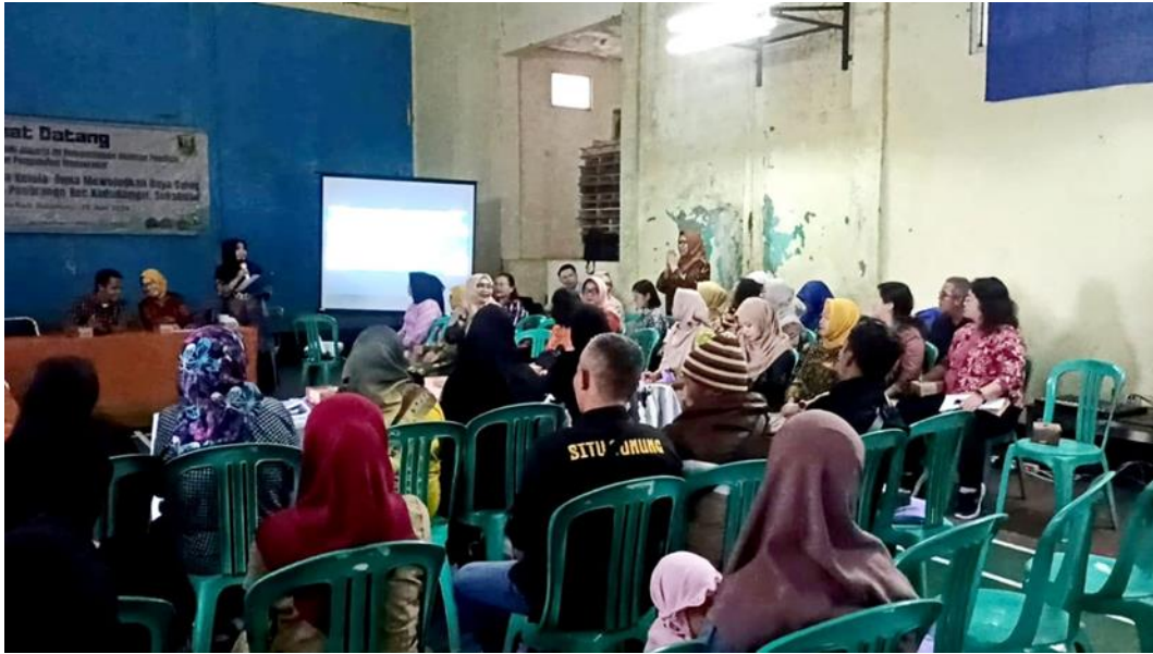
Figure 2. Atmosphere of training participants

The community service activities were carried out in the form of counseling, practice, and mentoring for 30 participants from UMKM. The training presenters were lecturers from 15 DKI Jakarta universities which are the forum for accounting lecturers in the DKI Jakarta region-IAI KAPD universities. Lecturers were grouped into several groups (Teams) according to their fields of competence, each group provided accounting training materials according to the standards and then monitored directly at the participants' desks to find out whether the ongoing training could be understood. Thus, it is known that the abilities of the training participants and the businesses that have been run so far have been effective and efficient according to expectations.