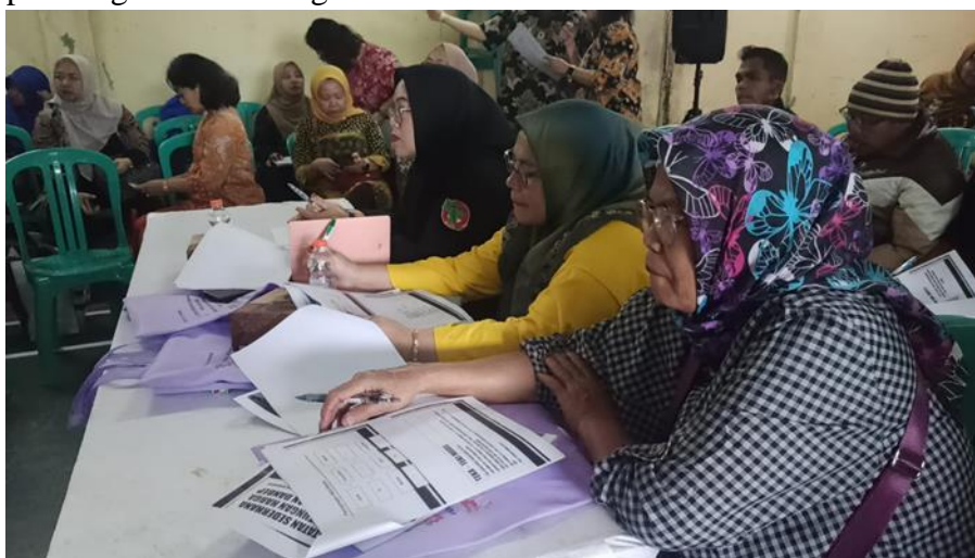
Figure 6. Participants Taking the Post Test when the counseling is finished

After the implementation of community service activities on "Development of MSME Businesses Through Accounting Education in Economic Improvement Efforts in Kadudampit Village, Sukabumi Regency", an evaluation was conducted to assess the success and impact of the activity. One of the evaluation methods used was the provision of a post-test related to the material on planning and recording MSME cash funds.