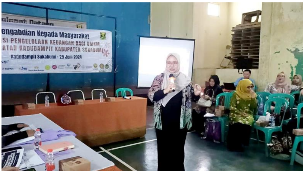
Figure 3. Presentation of product cost determination from the PKM Team

The community service activities were carried out in the form of counseling, practice, and mentoring for 30 participants from UMKM. The training presenters were lecturers from 15 DKI Jakarta universities which are the forum for accounting lecturers in the DKI Jakarta region-IAI KAPD universities. Lecturers were grouped into several groups (Teams) according to their fields of competence, each group provided accounting training materials according to the standards and then monitored directly at the participants' desks to find out whether the ongoing training could be understood. Thus, it is known that the abilities of the training participants and the businesses that have been run so far have been effective and efficient according to expectations.