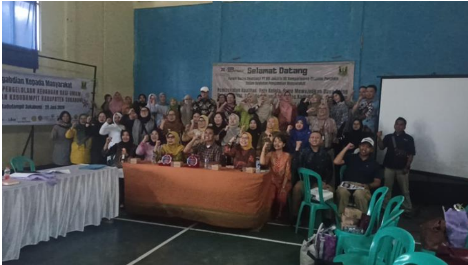
Figure 8. Group Photo of PKM Team and Participants after the Activity