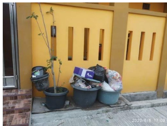
Photo of garbage accumulation around the Cimanuk River and Perum Mandala (2020)

In addition to having an impact on environmental pollution, prolonged use of plastic also has an impact on health, especially diseases that are vulnerable to women, namely women's reproductive health. As happened to the mothers of the Majelis Ta'lim Al-farizi community in Perum Mandala, Sukamentri Village, Garut Kota District.