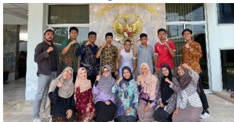
Picture 14. Commemorating the Independence Day of the Republic of Indonesia at the Indonesian Consulate, Sogkhla

On August 17, 2023, the Indonesian Independence Day was celebrated. 15 students received an invitation to attend the ceremony at the Songkhla Consulate of the Republic of Indonesia. All Indonesian citizens in Southern Thailand attended and followed the event with wisdom, not only the independence ceremony at the consulate held competitions and door prizes. The event was very lively and crowded we were able to get acquainted with the Indonesian people who were KKN or working in Thailand.