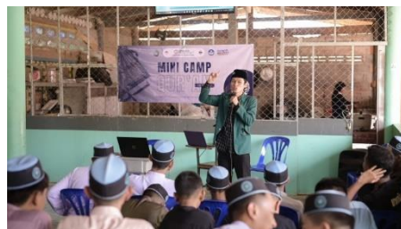
Picture 7. Quranic material