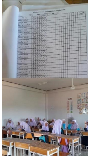
Picture 19. Remedial class