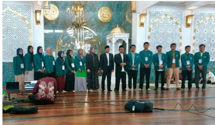
Picture 1. Group photo with the Rector of Ibn Khaldun University of Bogor and the head of LPPM at the graduation ceremony

KKN students of Ibn Khaldun University of Bogor serving at Singhanakhon Wittayanusorn School, Thailand, Songkhla were released at Al-Hijri Mosque 2, Ibn Khaldun University of Bogor.