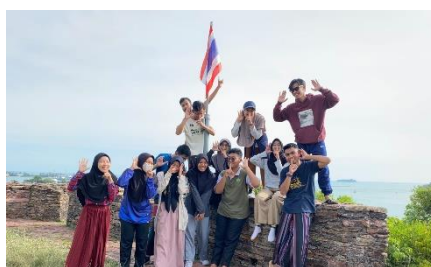
Picture 25. Battle Defense Fortress

Activities to visit the Battle Defense Fort History of the formation of the old Songkhla Region with new Songkhla