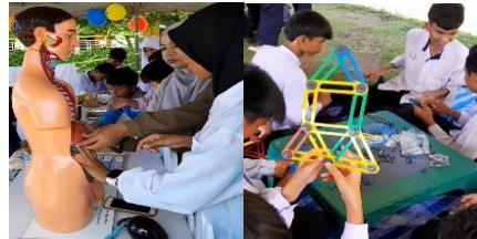
Picture 22. Project Science