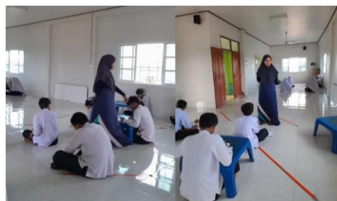
Picture 18. Student pre-exams

The exam questions are made by the teacher according to the subject and according to the applicable curriculum. The exam is held 1 week (1 week) according to the lesson schedule set by the school. After the exam the teachers correct and assess the results of the students' work, if there are those who get scores below the average or fall into the remedial category, the teacher gives a retest as proof of improvement in student grades.