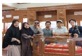
Picture 27. Museum Cerita Rakyat Institut Studi Thailand Selatan, Universitas Thaksin

A visit to the Folklore Museum of The Institute For Southern Thai Studies, Thaksin University.