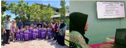
Picture 10. Airlangga University Surabaya's guests teamed up to send students to Singhanakhon Wittayanusorn School

Selain mengajar mahasiswa diminta untuk bisa menjadi Moderator ketika ada tamu dari luar sekolah, seperti contoh ketika Singhanakhon Wittayanusorn School kedatangan Tamu dari Universitas Airlangga Surabaya, Persatuan Alumni Majelis Islam Malaysia, dan Persatuan Guru Besar Malaysia. Saya diminta untuk menjelaskan kepada para tamu terkait profil sekolah. Tujuan para tamu datang adalah untuk menjalin silaturahmi dengan pihak sekolah, ingin mengetahui perkembangan sekolah dan memberikan sumbangan atau dana bantuan kepada sekolah serta menjalin kerja sama antara pihak sekolah dan pihak yang bersangkutan. Singhanakhon adalah sekolah Islam kedua di wilayah Singhanakhon, Songkhla.