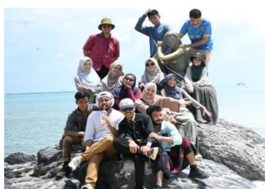
Picture 26. Samila Beach

A visit to Songkhla's Samila Beach. This beach is one of the favorite tourist attractions of migrants in addition to a very beautiful view and many halal food vendors.