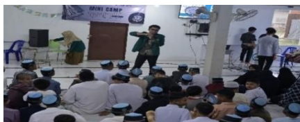
Picture 6. Prayer Practice Material

The content of Research / Community Service in the form of achievements from Research / community service activities that have been carried out. Research / service results can be in the form of tables, graphs and images and are accompanied by a discussion of the results of the discussion of community service activities.