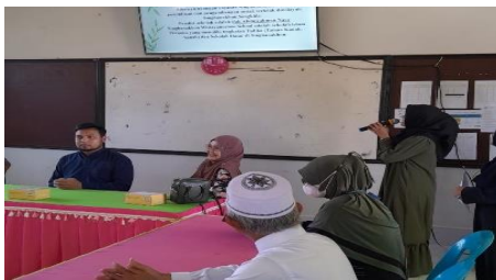
Picture 12. Guest of the Malaysian Union of Professors