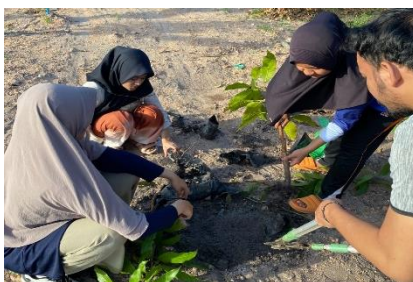
Picture 24. Mango Tree Seedling Planting Activity