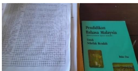
Picture 17. Assessment for students

In addition to providing material, I also give quizzes which aim to sharpen students' memory in receiving the material that has been given. The quiz given contains 5-10 questions about the material that has been delivered, the appreciation that I do to students is that if students are able to complete all the tasks given, they will get an A + for students who are able to complete everything and are correct, if students are able to complete everything but there are still mistakes, they will get a B +, so that students are eager to learn between lessons we always invite students to play guessing games in Malay and if students cannot then there is a penalty, namely students must come forward and introduce themselves in Malay.