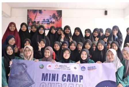
Picture 4. Group photo with Bambrungsuksa School Female Students

The first activity that was carried out together with Minicamp qur'an was located at BambrungSuksa School.