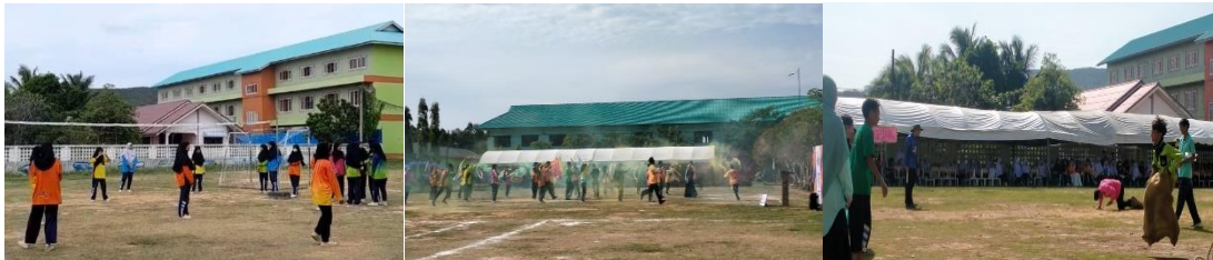
Picture 20. Sports

Sukan Olahraga or Sports Week is an activity to commemorate the Sports Day Celebration in Thailand, this activity contains various sports activities carried out by all students for 1 week and at the end of the sports celebration there is a sports competition which makes matches for students and gives prizes to the winners of the competition. This activity is routinely carried out every year, because it has become a tradition in Thailand, and also this activity is carried out by all schools in Thailand.