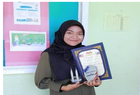
Picture 13. Presentation of certificates given by Malaysian professors to Singhanakhon Wittayanusorn School

On August 17, 2023, the Indonesian Independence Day was celebrated. 15 students received an invitation to attend the ceremony at the Songkhla Consulate of the Republic of Indonesia. All Indonesian citizens in Southern Thailand attended and followed the event with wisdom, not only the independence ceremony at the consulate held competitions and door prizes. The event was very lively and crowded we were able to get acquainted with the Indonesian people who were KKN or working in Thailand.