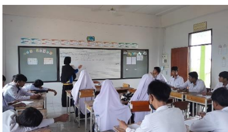
Picture 15. Co-teaching with a permanent Malay teacher

The role of students at school is not to be a permanent teacher or a substitute for teachers at school, rather to be a teacher's partner in the same subject, the aim is to ease the teacher's task when teaching and sharing knowledge with permanent teachers at school, when the teaching schedule starts when the permanent teacher cannot be present then we are responsible for replacing to enter the classroom teaching alone with unaccompanied students, if the permanent teacher is available then we enter the class together by sharing tasks and helping each other in teaching students.