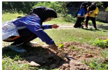
Picture 23. Planting Mangrove Tree Seedlings

This activity is a student academy program that is carried out only by grade 6, the aim is to fill academy activities outside of school. We were given education on the importance of mangrove plants to maintain a balanced and sustainable coastal ecosystem, and support human life and various other forms of life in the environment. The protection and preservation of mangrove forests is very important in an effort to maintain the balance of coastal ecosystems and address climate change.