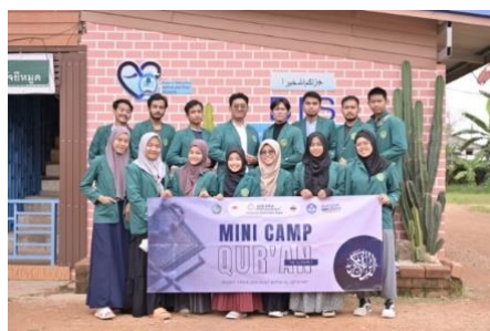
Picture 5. Photo with 1 team of 15 students of Ibn Khaldun University of Bogor

Qur'an Minicamp activities have several program arrangements, namely reciting together and practicing praying, the bonus is giving prizes to students who are active during the event.