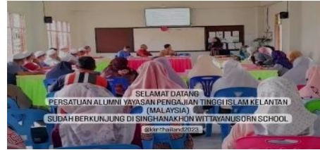
Picture 11. Guest of Persatuan Alumni Majelis Islam Malaysia