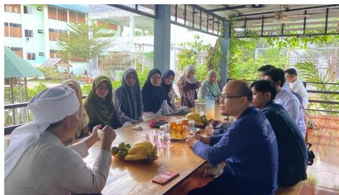
Picture 2. Students arrive at Solihuddin School, Thailand, Songkhla

KKN students arrived at Solihuddin School Thailand, Chana, a school that collaborates with Ibn Khaldun University of Bogor regarding International KKN chaired by LPPM. Students were warmly welcomed by the Director of Solihuddin School and other Solihuddin School staff. With the hope that students can give their best to the schools that will be placed according to the agreement that 15 students will be divided into nine schools in the Chana, Hatyai and Singhanakhon areas.