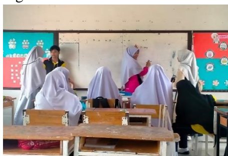
Picture 16. Teaching Process in the Malay Language Classroom

The teaching activities that I apply are quizzes and communication, aiming when students are given questions for students to come forward it is useful to train independence and courage to be confident in answering questions. When students are confident, a student character is formed that can be useful for their future in dealing with the problems they face. Students who are not afraid to try something positive and new are the next generation that must be directed to produce the next generation of the nation.