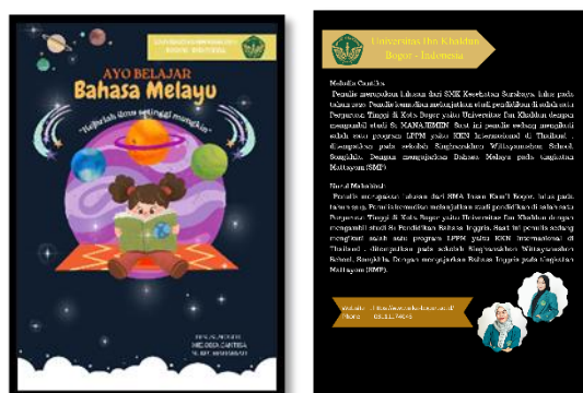
Picture 9. Ayo Belajar Bahasa Melayu book

Malay and English, therefore the school asked us to teach students Malay and English. Because in the previous year there had never been a Malay language lesson curriculum and there was only English, coinciding this year (semester 2023) there were Malay and English lessons. With the limited Malay language learning books that the school has, the school asked us as students to make teaching material books to learn basic Malay, with vocabulary that can be used in everyday life so that students can be applied in communication with people other than Thai people.