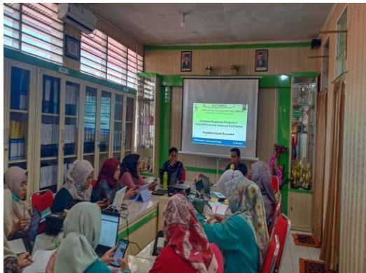
Figure 3. Puskesmas staff discuss with resource persons