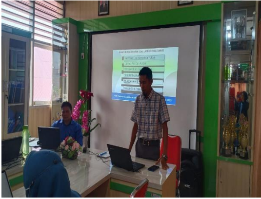
Figure 6. 2nd session moderator gave a speech