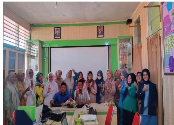
Figure 9. Photo with puskesmas staff