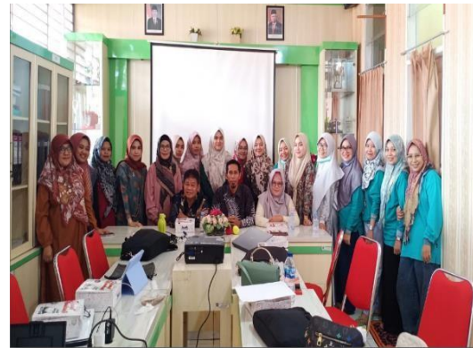
Figure 4. Group photo in session I

Delivery of material related to the Use of Google Drive in the 2nd Floor Meeting Room of the Ambacang Padang Health Center. The results obtained after pretests and posters were carried out using the Google form, the results were as follows: