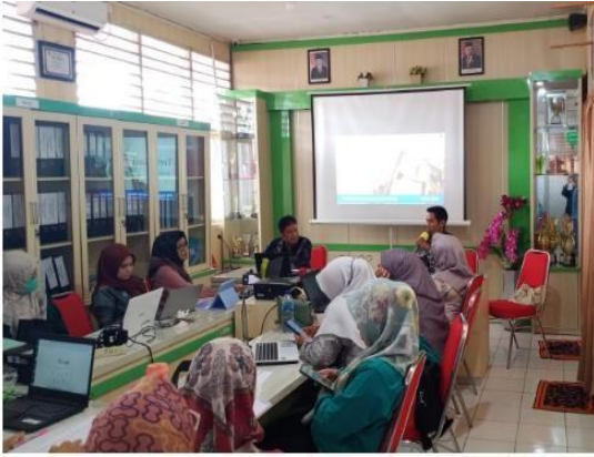
Figure 1. The moderator gave a speech