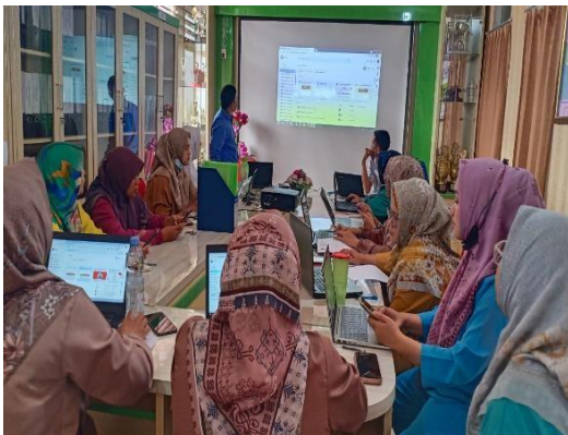
Figure 8. Resource persons provide exercises