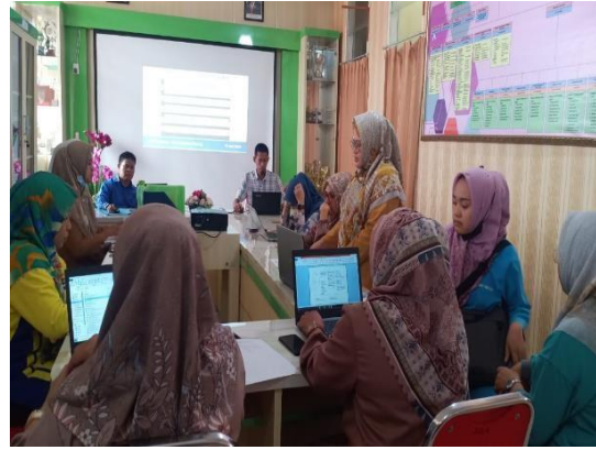
Figure 7. Greeting from one of the staff