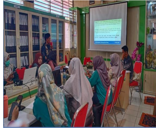
Figure 2. The source explained that google drive