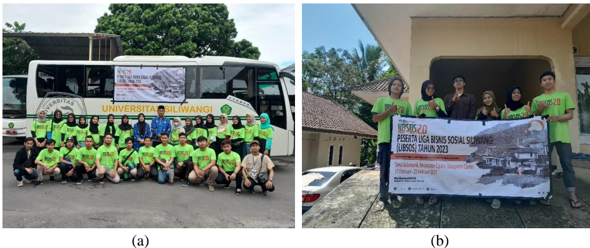
Figure 2. (a) Preparation for Departure, (b) LIBSOS participants who are at the post

A total of 25 students participated in LIBSOS activities in Ciamis Regency. The activities carried out by students are to make observations about the potential of social entrepreneurs in the Ciamis Regency area. Based on the results of observations made by students, there are several social entrepreneurs in Ciamis Regency, including in the food and agriculture sector.