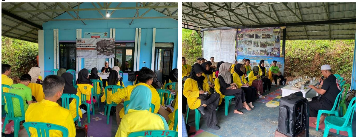
Figure 3. Welcoming LIBSOS participants by village officials

A total of 25 students participated in LIBSOS activities in Ciamis Regency. The activities carried out by students are to make observations about the potential of social entrepreneurs in the Ciamis Regency area. Based on the results of observations made by students, there are several social entrepreneurs in Ciamis Regency, including in the food and agriculture sector.