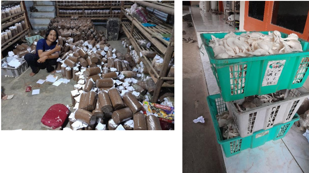
Figure 4. Observation of participants in the oyster mushroom business

Among the entrepreneurs found in Selamanik Village, Ciamis Regency is the cultivation of oyster mushrooms and processed food from bananas. Selamanik Village holds great potential in natural resources, besides that the local wisdom of friendly communities makes this region have a prosperous economic level.