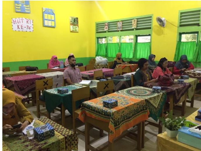
Figure 3. Google-Site Operation Practices and Learning.Id by Guru MGMP

In practice, teachers try to make their Google-Site pages in groups. This activity takes up to 2 hours. However, this activity was completed in one meeting with the teacher because the teacher had provided teaching materials to be inputted or entered into the google-site so that the process of making teaching materials did not take long, only the process of creating a google-site page and the procedures for using it were enough to make participants overwhelmed and need help (See Figure 3).