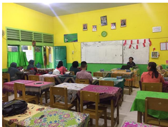
Figure 1. Opening of the Google-Site Usage Training Learning account integration.id

The initial activity of this community service activity is that the teacher conveys the topic of the implementation of the activity, namely a demonstration of the use of Google-site as a medium or tool that helps teachers make teaching materials with a very practical and acceptable level of distribution. Participants asked questions in the form of an initial process that must be carried out in the activity, namely having a laptop or cellphone to access the Google-site and having English teaching materials that will be inputted into the Google-site. In this process, the teacher has provided a laptop for group practice in the room provided, while the teacher follows the process by using their cellphone to open the Google-site (see Figure 1).