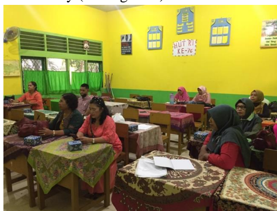
Figure 2. Explanation of the Operation of Google-Site and Learning Accounts.Id

examples of English teaching materials explained by the teacher, then members groups sitting close together can help immediately (see Figure 2).