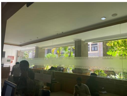
Figure 1. WP (Taxpayers who come to the office)

Application system development needs to be designed as an application management system to be more effective and efficient in managing service documents so that they are carried out more quickly when there are insufficient documents so that the quality of service becomes better.