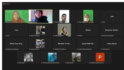
Figure 2. Webinar “Digital-based Bookkeeping Training for MSMEs”

Next, the team evaluates the implementation of the Integrative KKN-PPM activities at the end of each webinar to participants. Participants said that the webinar given to MSME actors had gone well even though the time for the webinar was relatively short. In addition, the material presented is also very good so that it provides knowledge for participants on how