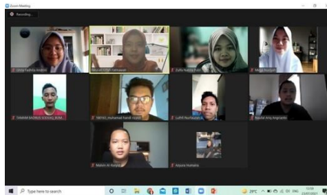
Figure 1. Preparation Stage

Lecturers and students coordinate online to discuss questionnaire questions that will be sent to MSME actors as a preliminary survey and discuss the technical implementation of the training, namely the determination of the training schedule and resource persons.