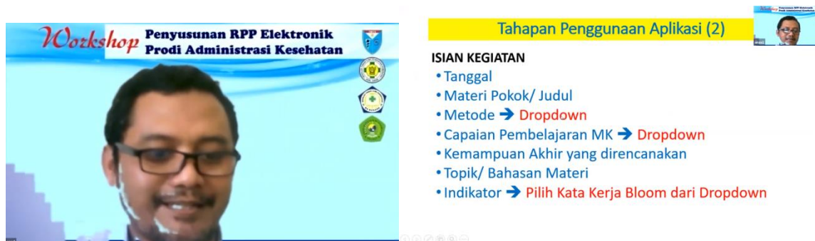
Figure 1. Electronic Lesson Plan Preparation Training